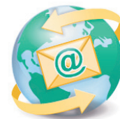
Sage E-marketing for Sage CRM

With Sage E-marketing for Sage CRM, users can quickly create personalised and targeted emails using over 90 highly professional email templates that cover all communication needs. Templates can be edited quickly and easily directly from within Sage CRM allowing you to personalise them with your logo, contact details, hyperlinks and call to action.